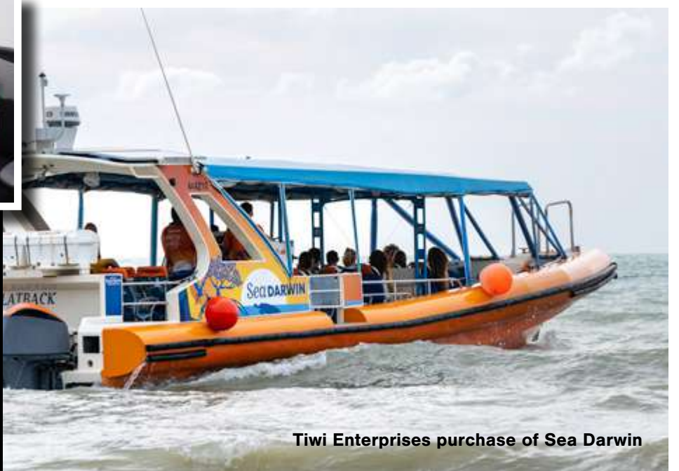
Tiwi Enterprises purchase of Sea Darwin